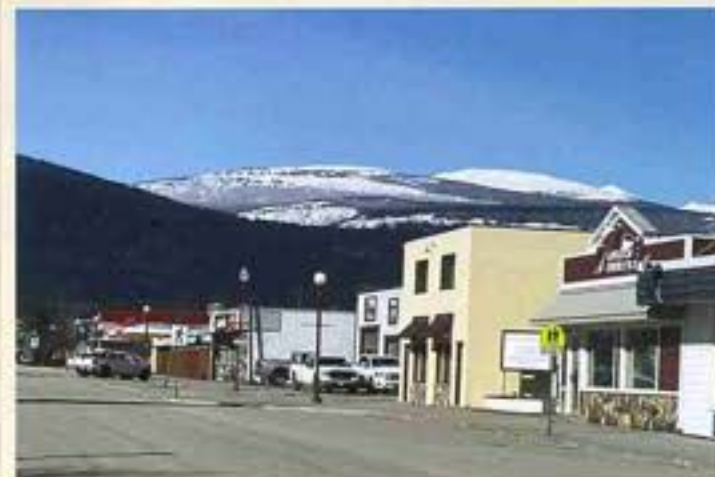
Belle Mountain from the main street of McBride!